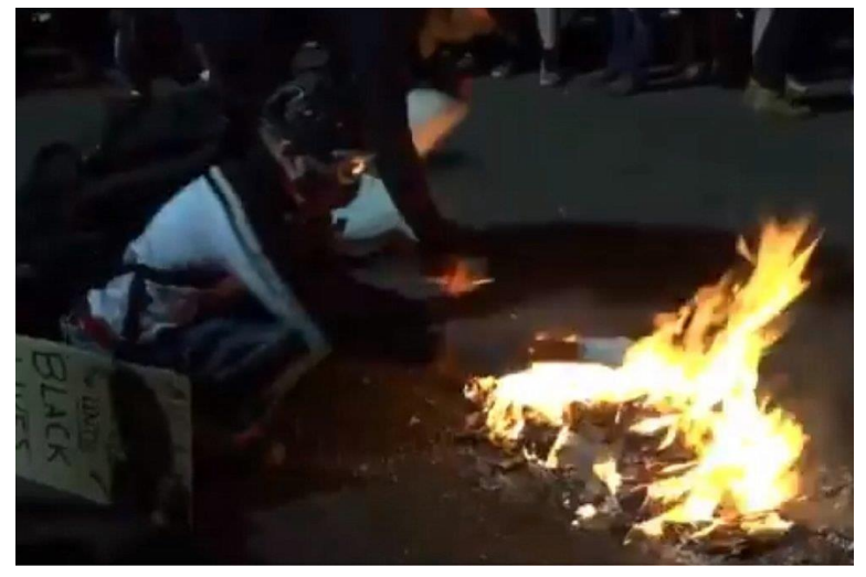
Protestors in Portland, OR burned Bibles

There are other indicators of animosity by protestors against Christianity. In early August of 2020 BLM protestors in Portland, Oregon burned both an American flag and Bibles. This began with one Bible being burned. Then someone brought a stack of Bibles to throw on the fire.<sup>27</sup> This reveals a rising opposition to the Christian faith. In the past, protests may have involved the burning of the American flag and other such images. However, the burning of