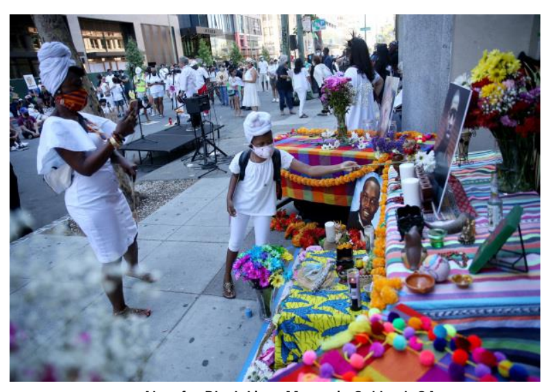
Altar for Black Lives Matter in Oakland, CA

Many leaders of the BLM movement have adopted Ifá as part of their protest activity. Ceremonies based on Ifá are performed before many BLM gatherings.<sup>36</sup> For example, on June 2, 2020 the Los Angeles Chapter of BLM conducted an "action" in front of the L.A. mayor's house to demand the defunding of the police. Part of this action consisted of reciting the names of blacks killed by police. As each name was recited the crowd chanted Asé. Asé (pronounced ah-shay) is a Yoruba word. It refers to the "the power to make things happen" or "so let it be."<sup>37</sup> It is both a way of affirming what has been said, similar to saying "amen," and also a calling on the spiritual powers. Dr. Melina Abdullah, co-founder of the L.S. BLM chapter, says that this ritual was "a form of worship."<sup>38</sup> You wonder why you have not seen photographs or videos of these Ifá rituals. Cameras are usually forbidden from such ceremonies due to a fear that these religious rituals will be misrepresented or negatively criticized.<sup>39</sup>