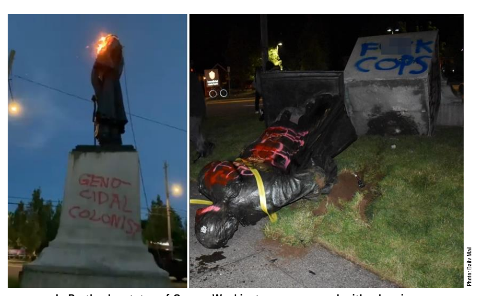
In Portland a statue of George Washington was covered with a burning American flag, and then toppled to the ground (June 19, 2020).

responders was damaged and painted red. In Cleveland the Soldiers and Sailors monument was painted with graffiti by rioters. In Birmingham, Alabama a memorial honoring those who died in WWI was damaged and defaced. Even statues honoring African-Americans were not exempt—for example the Boston statue honoring the all black 54<sup>th</sup> Regiment was vandalized, as was the Clayton Jackson McGhie Memorial in Duluth, Minnesota, which honored three African-American men who were unjustly lynched for a crime they did not commit. There seems no rhyme or reason for such violence. It is simply rage expressed through destruction and vandalism.<sup>65</sup>