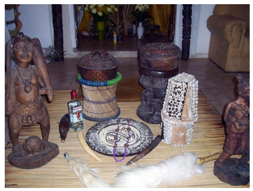
Idols, implements of divination and other Ifá objects

worshiper.<sup>41</sup> From a biblical standpoint, this is idolatry. It is also demonic, because the Bible clearly indicates that false pagan gods are actually demons (see Deuteronomy 32:16-17, Leviticus 17:7, 1 Corinthians 10:20-22).