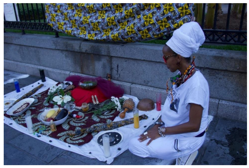
Altar for Black Lives Matter in New Orleans

Much of the ceremony in BLM gatherings is based on pagan religion, especially Ifá (see below). Ifá is not only a religious system, but a divinatory and magical discipline. Seeking the guidance of spirits, ancestor worship, magic and divinatory practices are all part of Ifá, and have influenced the BLM movement. For example, an associated organization of BLM is Dignity and Power Now (DPN), a group which promotes social justice and health issues through what they term "healing justice." DPN was founded by Patrisse Cullors. DPN hosts "Wellness Clinics" to promote physical, mental and spiritual health in black communities. These clinics utilize a variety of techniques, including drum circles, meditation, building community altars, and "oracle card readings," e.g. the Tarot.<sup>34</sup> It must be noted that the Bible condemns all forms of divination as sinful and an abomination in God's sight (cf. Deuteronomy 18:9-14, Leviticus 19:26, Zechariah 10:2, 2 Kings 17:17).